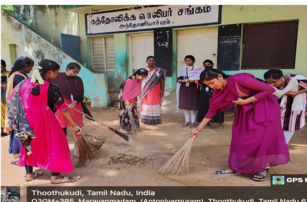
Thoothukudi, Tamil Nadu, India Q36M+3R5, Maravanmadam, (Antoniyarpuram), Thoothukudi, Tamil Nadu 62 Lat 8.775114° Long 78.08471° 15/08/24 11:06 AM GMT +05:30